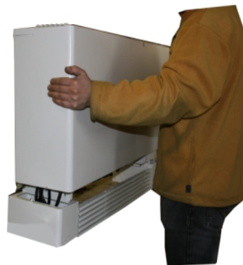
2 Remove the casing.