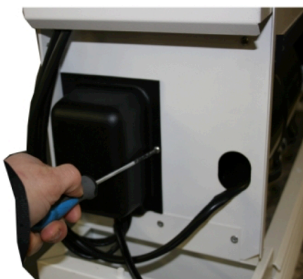
4 Remove plastic cover.