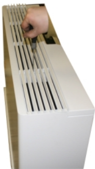
1 Unscrew casing's screw.